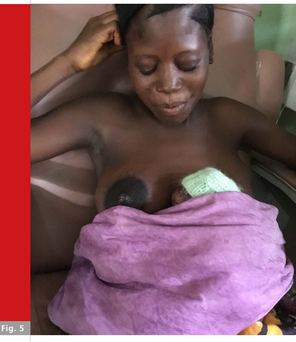
Case Report 1: Feeding and growing in Kangaroo care.