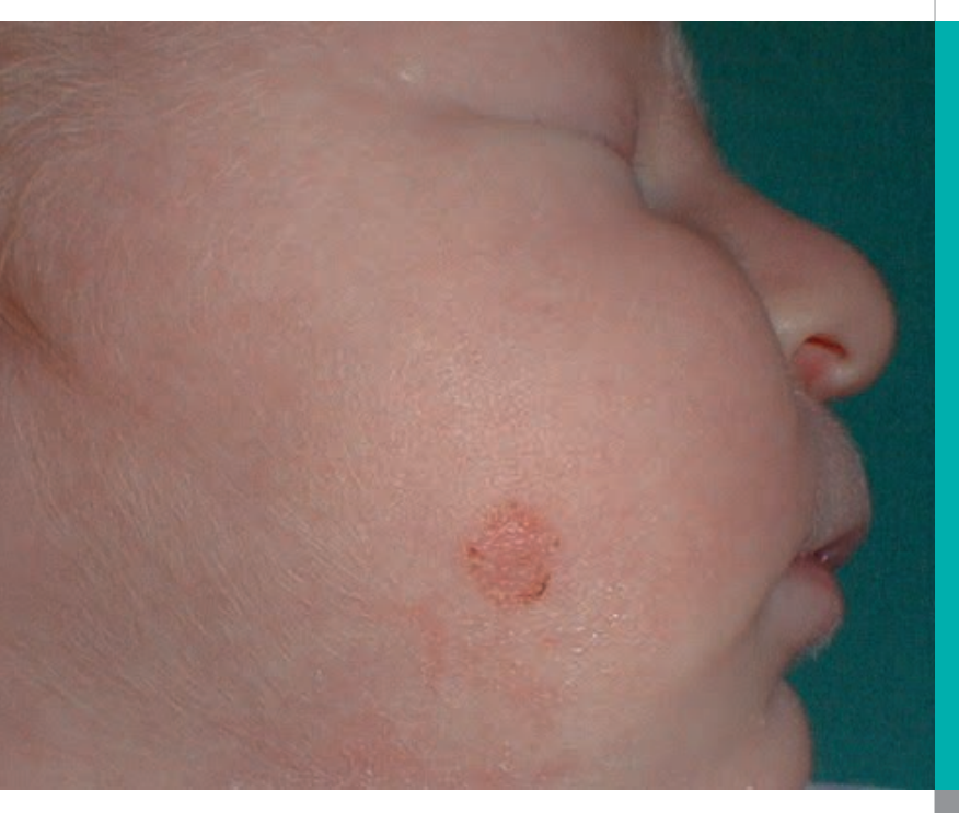
Face: typical skin lesion.